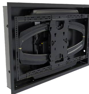
Complete mount installation without display