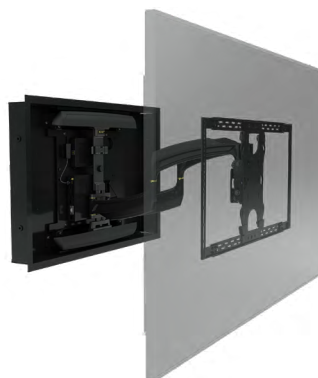
TS525TU Thinstall Dual Swing-Arm Mount extended with TAB1 and TA500 In-Wall Box, sold separately