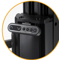
INTEGRATED CONTROL PAD