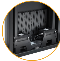
CABLE MANAGEMENT & STRAIN RELIEF